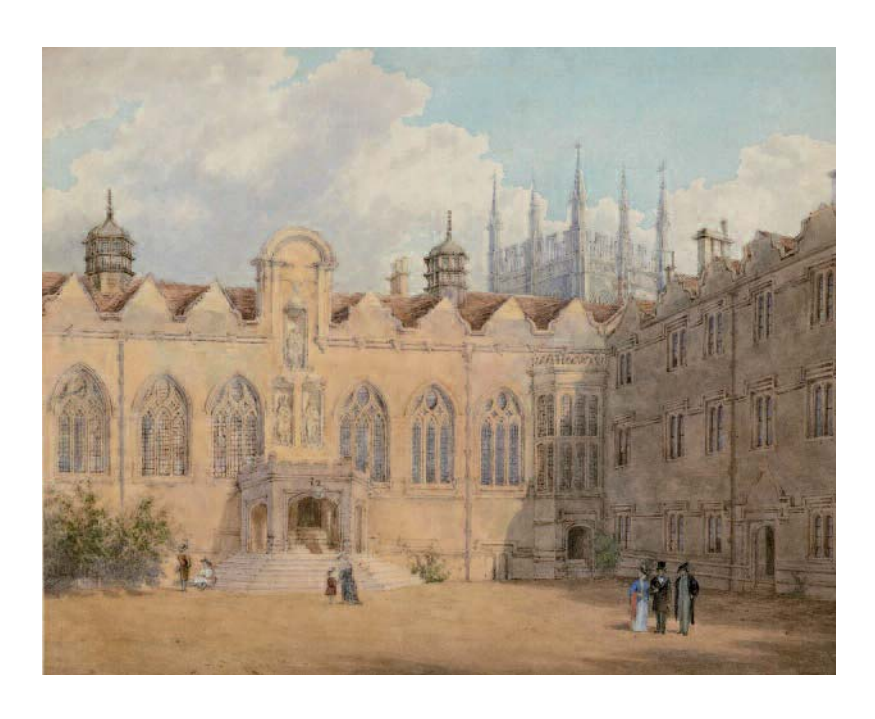
Front Quad, Oriel College, Oxford watercolour and pencil 10½ x 13¾in (26.5 x 35cm)