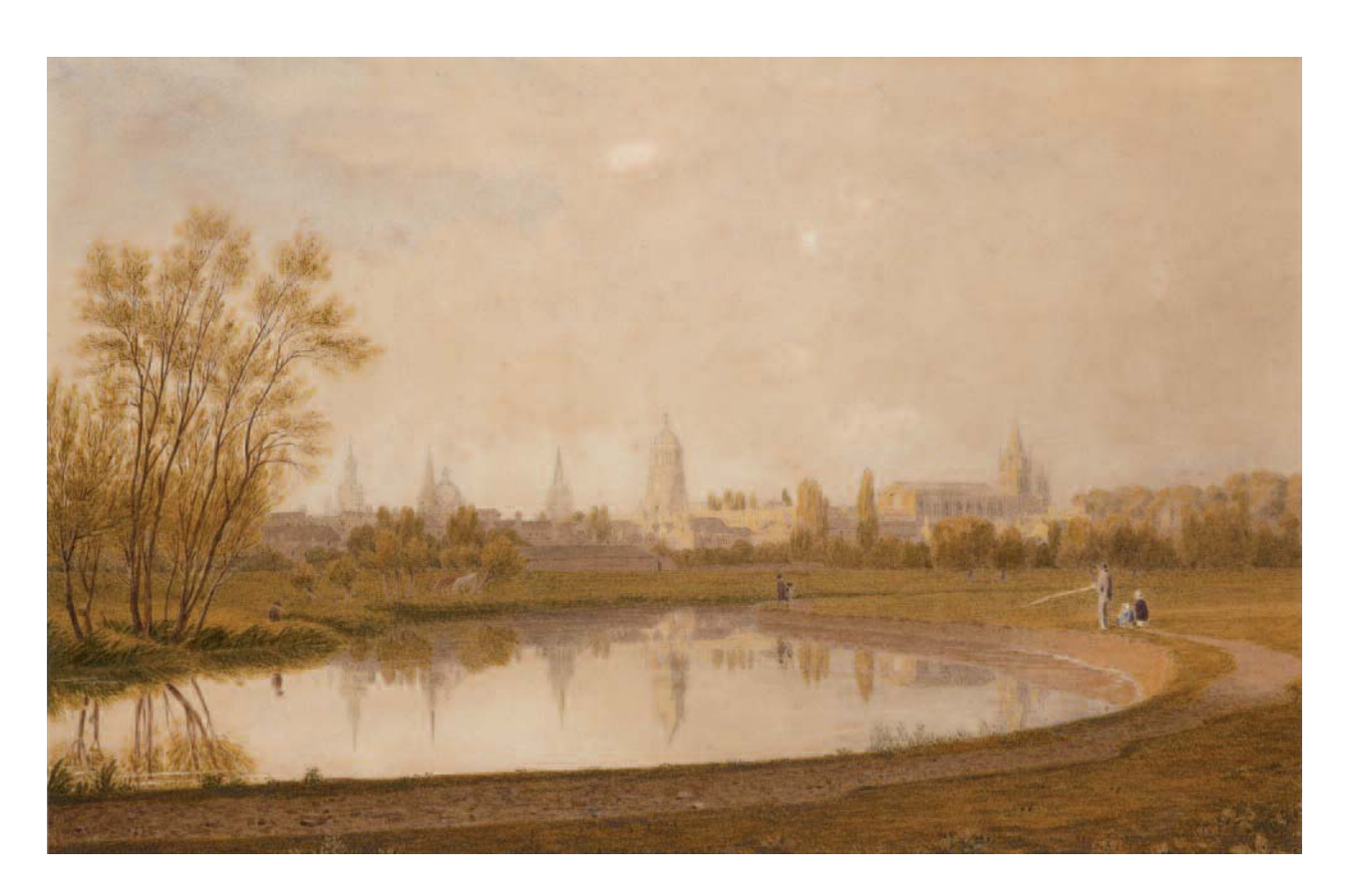
A View of Oxford from Osney watercolour 9<sup>3</sup>/<sub>4</sub> x 15<sup>3</sup>/<sub>4</sub>in (25 x 40 cm)

It is particularly fitting to be able to offer here one of William Turner's views of Oxford as his name is indelibly linked with that city, just as Constable will be ever associated with the vicinity of East Bergholt and the neighbouring Stour Valley. Turner was sent to London at the age of fifteen to take up an apprenticeship under John Varley, and was elected a full member of the Old Watercolour Society in 1808. It was in this period that J.M.W.Turner rose to fame, and as a result the younger artist became known as 'Turner of Oxford'. His own reputation firmly established, he returned to his uncle's estate at Shipton-under-Cherwell in 1811 and spent the next few years sketching the Oxfordshire countryside, in particular the meadows along the Cherwell. He continued to submit his work to the Society's exhibitions in London and, at the same time, continued to build up his practice as a drawing master in Oxford.