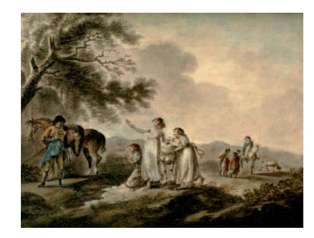
The Sale of the Pet Lamb pen and ink, and watercolour 8½ x 12¼ in (21.6 x 31.1cm) After the watercolour of the same title in the V&A.

John Mitchell & Son, 1970, no. 25; London, John Mitchell & Son, 1999, Ibbetson loan exhibition.