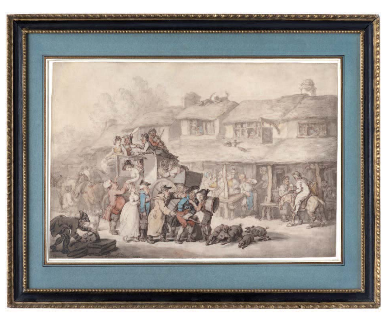
The arrival of the stagecoach at Bodmin, Cornwall watercolour, pencil and pen & ink 12¾ x 18½in (32 x 47cm) signed and dated 1807

Rowlandson visited Bodmin on numerous occasions from the mid-1790s until 1817. His attention was clearly caught by the town's ancient buildings as they appear in several of his drawings. Ours compares closely with a similarlytitled watercolour of 1795 (see J. Riley, Rowlandson drawings from the Paul Mellon Collection , exhibition catalogue, 1978, no. 58, p.42)