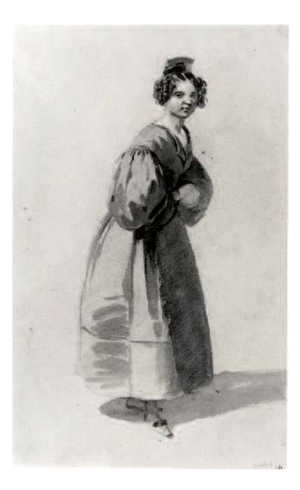
A Study of a woman, standing full length pencil and wash with white heightening 13¼ x 8 in (33.5 x 20.5cm) signed