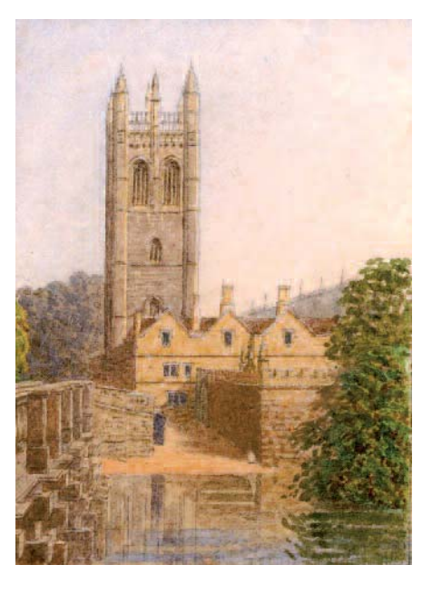
Oxford: Magdalen Tower from Magdalen Bridge watercolour and pencil 4¾ x 3in (12 x 7.5cm)