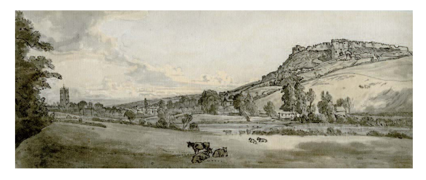
Carisbrooke Castle, Isle of Wight pen and ink, and watercolour 5 x 12in (12 x 30.5cm)

From time to time Barret would collaborate with other artists, notably Joshua Cristall around 1830, and in 1840 he published The Theory and Practice of Water-Colour Painting . His watercolours can be found, among others, in the Royal Collection at Windsor, London's Victoria and Albert Museum, the British Museum and the Fitzwilliam Museum in Cambridge.