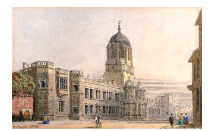
Christ Church College, Oxford watercolour & pencil heightened with bodycolour 3½ x 4¾in (12.5 x 8.2cm) signed and dated 1868 and inscribed on reverse 'Christ Church Coll Oxford West Front'