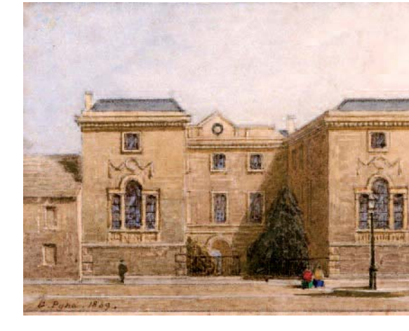
Worcester College, Library exterior watercolour and pencil 3¼ x 4½in (8 x 11.5cm) signed and dated 1869