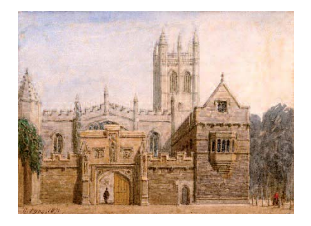
Magdalen College, Oxford watercolour & pencil heightened with bodycolour 3¼ x 4½in (8 x 11.5cm) signed and dated 1871