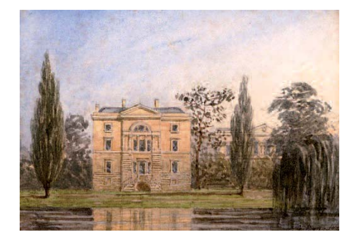
Worcester College, Oxford, Provost's Lodgings watercolour and pencil 3¼ x 4½in (8 x 11.5cm) signed and dated 1878?