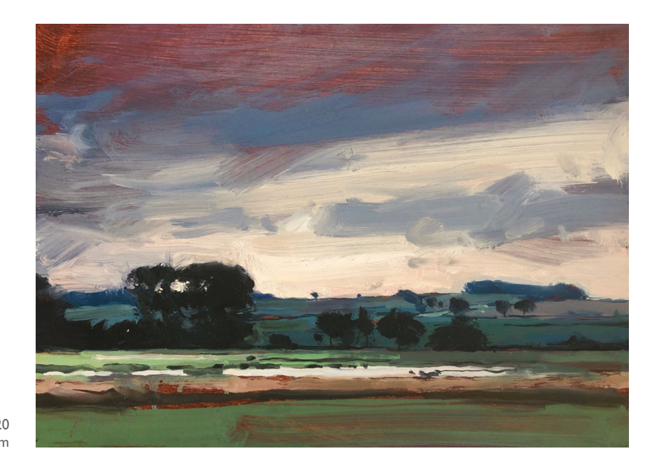
Trees, Grey and Green 2020 oil on acrylic on card 20 × 30 cm

Storm and Shipwreck, Brancaster 2020 oil on gesso on panel 30 x 42 cm