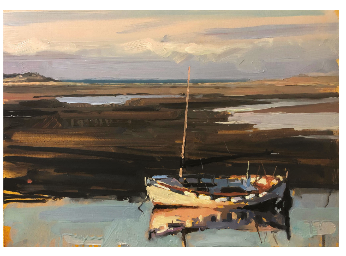
Boat, Evening 2019 oil on gesso on board 30 x 42 cm

Cloud over Royal West Norfolk Golf Club 2020 oil on acrylic on card 20 x 30 cm