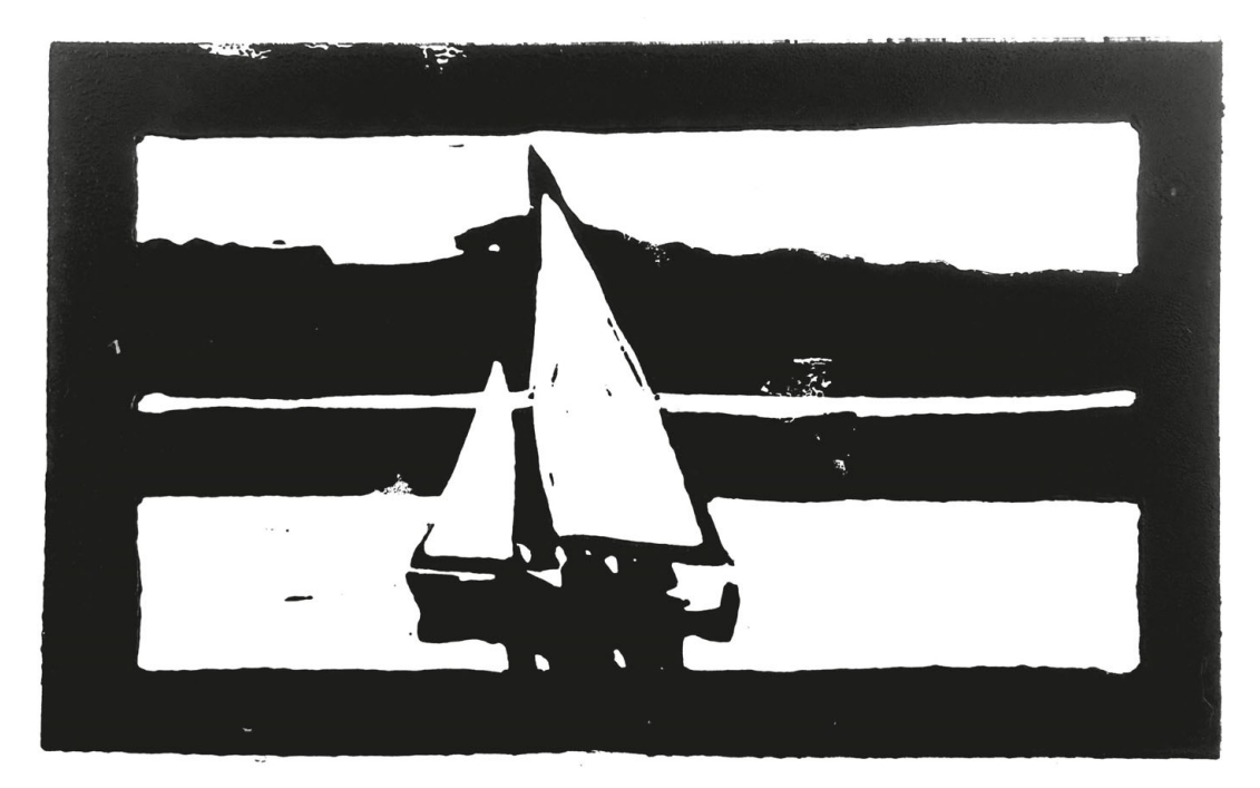
Sail on Horizontal 2020 linocut on paper 14 x 23 cm, edition of 20