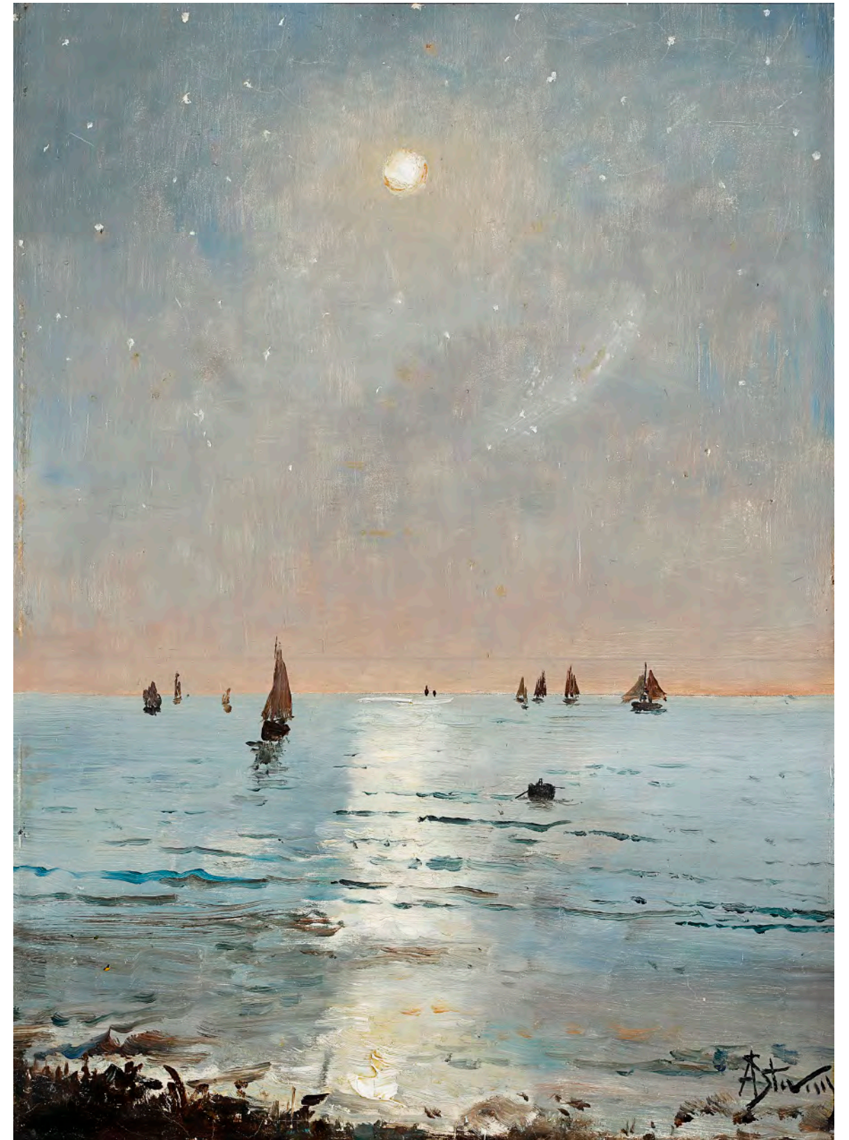
ALFRED STEVENS (1823-1906)

oil on canvas, 22 x 18 in. (56 x 46 cm.) signed