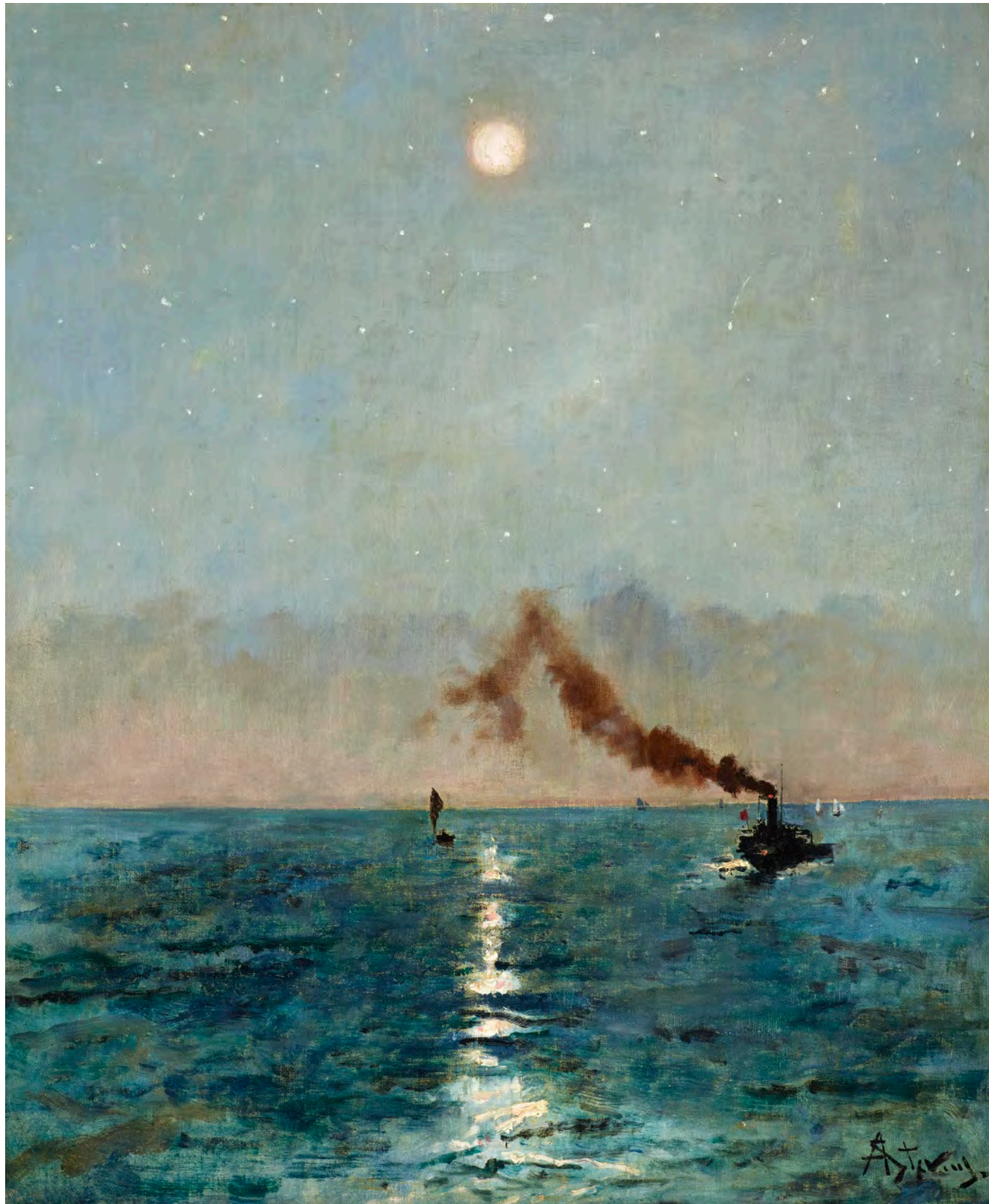
ALFRED STEVENS (1823-1906)