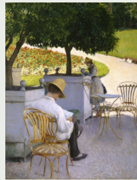
fig 2, Les Orangers , oil on canvas, MFA Houston