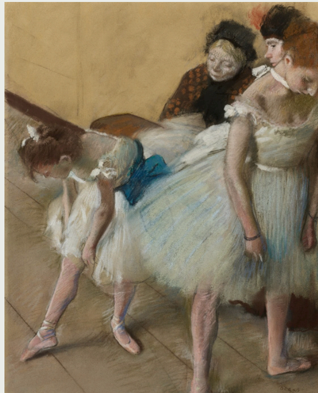
fig 1, The Dance Examination , c.1879, pastel, Denver Art Museum

The theme of ballerinas began in the 1870s, and remained a principal subject throughout his oeuvre . He gained a wide knowledge of classical dance, and was granted privileged access to studios to observe classes and rehearsals. The early ballet pictures were ambitious multi-figured scenes, often painted in oil. However, over the following decades he put fewer figures in his pictures, often shown in a quiet moment backstage or in the stage wings (fig1). For these intimate portraits Degas increasingly turned to softer media such as charcoal and pastel, keenly contrasting the contours of the figure, with the soft modulations of tone and colour in the gauze dresses.