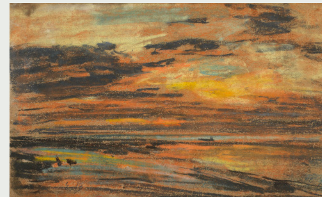
fig 1, Eugène Boudin, Sunset on the Beach , pastel, Fitzwilliam Museum, Cambridge

Raised in Le Havre, Monet started out drawing caricatures, until he met Eugene Boudin, who convinced him to pursue landscape painting. Moving to Paris he continued his training, first in the Académie Suisse in 1860 and thereafter in the studio of the Swiss history painter Charles Gléyre, where he worked alongside Renoir, Sisley and Frédéric Bazille. During the 1880s Monet returned to the Normandy coast. He found inspiration in the sparkling light and famous limestone cliffs, as had Delacroix and Courbet. As well as working directly in oils, he followed Boudin's example (fig 1) and used black chalk and pastel to study the effects of light and colour on the sky, sea and land.