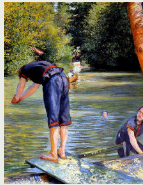
fig 1, Baigneur s'apprêtant à plonger , 1878, oil on canvas, private collection

Gustave Caillebotte was an invaluable exponent in the Impressionist movement, revered as much as a patron and benefactor to the group, as well as an active member himself. Rich and well connected, he played a crucial role in organising and financing the eight Impressionist exhibitions and showed his own work in five of them (1876, 1877, 1879, 1880 and 1882). He collected paintings by his fellow artists from the mid-1870s onwards both for their quality and to support his friends, and upon his untimely death in 1894, he bequeathed the collection of nearly sixty works to the French State, for display in the Musée du Luxembourg. The Caillebotte bequest forms the heart of the Impressionist collection to be found in the Musée d'Orsay today.