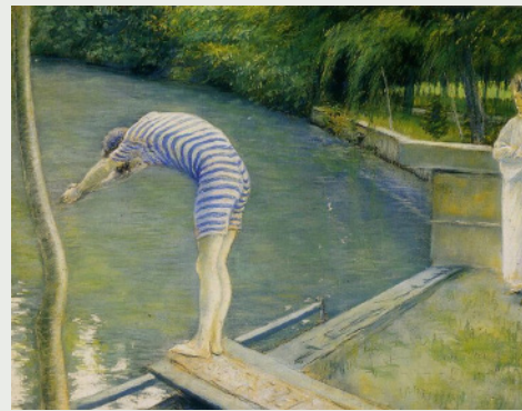
fig 3, Baigneur s'apprêtant à plonger , pastel, Musée d'Orsay

Caillebotte's father was a successful entrepreneur and investor who purchased an estate at Yerres to the south-east of Paris. The house and its grounds were the setting for many of Caillebotte's paintings in the 1870s, including this baigneur , drawn from a large painting (fig 1) executed there in 1878. This was the final summer he would spend at the family home before it was sold in 1879 after his mother's death. Several of Caillebotte's greatest paintings come from this period including The Floor Scrapers (Musée d'Orsay) and Les Orangers (fig 2), both created in the summer of 1878.