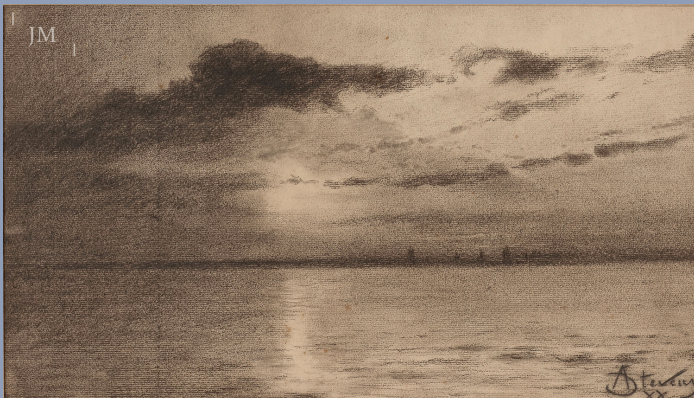
Alfred Stevens (Belgian, 1823 - 1906)

Coucher de Soleil charcoal on paper, signed 10 x 17¾ in. (25.4 x 45 cm.)