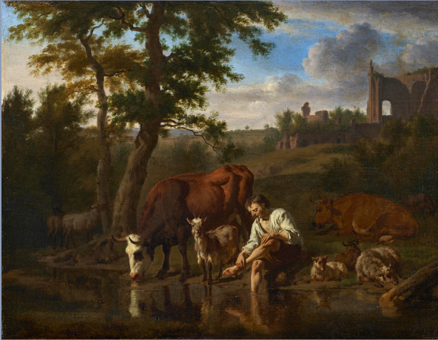
Adriaen Van de Velde (Dutch, 1636-672)

A Herdsman and Cattle at a Stream oil on canvas on panel, signed 14¾ x 18 ½ in. (37.5 x 47 cm.)