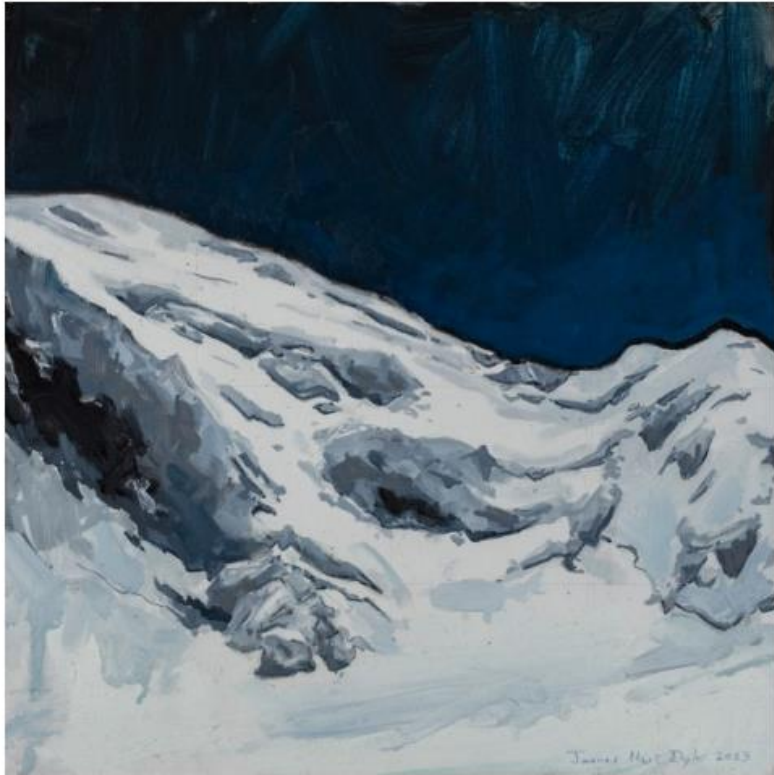
The Ancien Passage