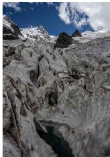
Above the 'Junction'

This section of the climb lies above what is called La Jonction at the top of the long rock ridge going up Mont Blanc's north face from the Chamonix valley. It took Balmat and Paccard fourteen hours to get to the summit from there which tells us a good deal about the route-finding involved. The two glaciers which fork at this point, (this 'junction') the Bossons and the Taconnaz, have now shrunk drastically. The change since the mid-twentieth century alone is staggering and once the last snows melt