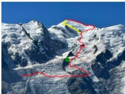
Mont Blanc: the north face showing the 'Grands Mulets' route and that of the ancien passage in yellow. The Grands Mulets hut shown in green.

For such a monumental achievement the lack of any account by either of the explorers themselves is still an unsolved mystery. The subsequent falling out between Balmat and Paccard as to who was the stronger and more intrepid climber almost overshadowed their conquest. As such, the most reliable source remains that of Balmat transcribed and written down by the chronicler and climber Marc Bourrit in November of the same year. In 1784 and 1785 Bourrit had attempted the ascent of Mont Blanc and subsequently failed again in 1788. Given his own considerable experience on the mountain, there is little doubt that his transcription of Balmat and Paccard's feat, entitled Le Premier Voyage fait au sommet du Mont Blanc, le 8 août dernier is as close as possible to what took place.