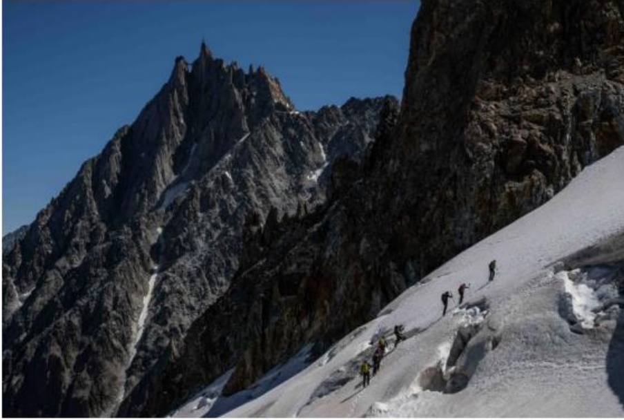
Christophe leading up the Glacier des Bossons with the Aiguille du Midi behind

He needed the space and moment to ready himself and then we all got going from down below the hut at 9 a.m. It turned out to be one of the hottest days of the year. By leaving early we managed to escape the worst of the heat and most importantly ascend whilst the snow was still firm. Every few hours we would stop to drink something and find somewhere for James to make sketches. In the approaches to the Petit and Grand Plateaus we encountered some gargantuan crevasses and once the angle of the slope increased, we were threading our way up towards what looked like a huge amphitheatre of snow and ice.