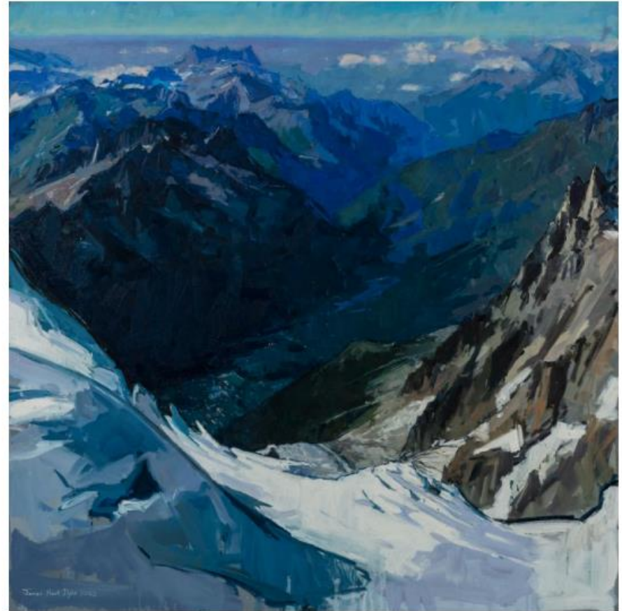
Chamonix from the Arête des Bosses

'From here there is scarcely anything to be seen but snow, pure and of a dazzling whiteness, contrasting strangely with the almost black sky of these lofty regions. No living being is to be seen, no trace of vegetation; it is the adobe of frost and silence.' The stark high-altitude landscapes lend themselves to a monochromatic palette. It imparts a timeless and surreal sense of the place. James has always been interested in Gerhard Richter's black and white paintings and although this composition is mainly black and white, he injected some blue into the sky and tried to achieve a sense of distance and scale by using soft edges on the summit sliding to a hard edge on the Arête des Bosses. Ancien Passage is much more about the void, the space created and delineated by the mountain, than it is about Mont Blanc.